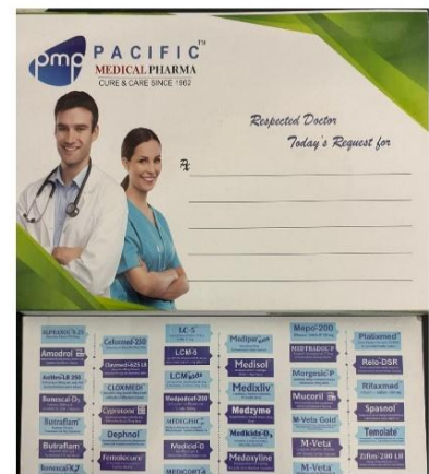
LBL / REMINDER CARD